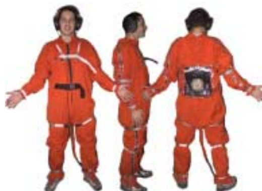
Figure 3. Second version of the vibrotactile suit.

When working with vibrotactile devices, it is essential to maintain a tight interface between the tactor and the skin. Elastic straps with Velcro were used toward this end; in addition to providing the necessary pressure, they are inherently adjustable. The first version of the suit required the user to strap on each transducer individually. The shoulder transducers were held on via a harness-like contraption and the Interactor was strapped to the back of a Herman Miller chair (which was chosen for its low-impedance mesh backing). In version two of the system, all of the transducers and wires were embedded in a nylon suit as shown in Figure 3. A one-size-fits-all design was required, so the suit was designed to be loose fitting, with external elastic straps at each transducer point. An elastic shoulder harness, which could be adjusted by pulling down the straps located just above the breasts, was sewn into the suit to secure the shoulder transducers. The Interactor is held against the lower back by two adjustable belt straps that wrap around the torso. The outer cover of the device was removed to reduce the weight load. The transducer wiring was routed through channels running along the lengths of the arms and legs and down the back, and exits in the form of a tail. A tail was chosen over an umbilical chord because it hangs from the suit more naturally.